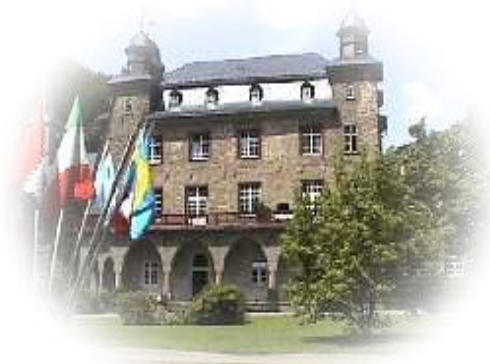
IBZ Gimborn Castle - the IPA's educational establishment

Further information is available by downloading the accompanying document